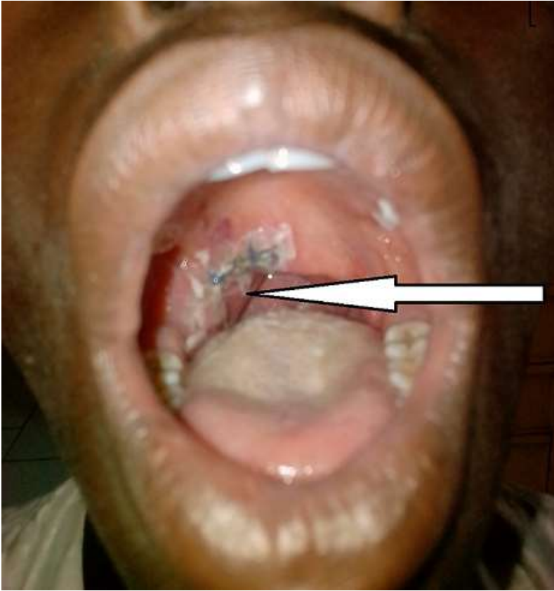
Figure 2: postoperative appearance after tumor reduction surgery