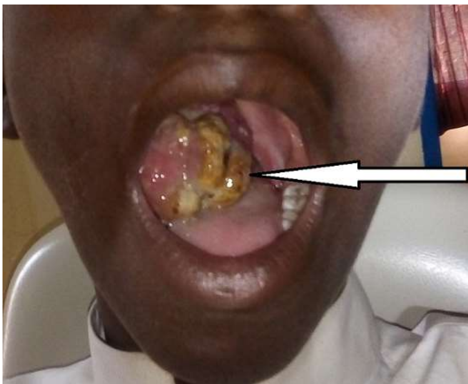
Figure 1: aspect of the oropharyngeal tumor on clinical examination