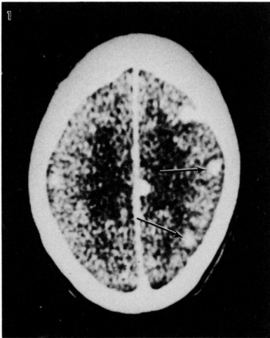
FIG. 1. CT scan of brain showing several discrete contrast-enhancing brain lesions ( arrows ) initially thought to represent tumor metastatic to brain. Subsequent pathological examination, however, showed them to be of infectious origin (patient No. 1).

nourished, and in no acute distress. Although she was drowsy, she was able to recount her history as noted. Her review of symptoms was otherwise negative. Physical examination revealed a right medial gaze palsy (III), a left lateral rectus palsy (VI), a right central facial nerve palsy (VII), and right hypoglossal (XII) nerve palsy. Her general physical examination was otherwise unremarkable.