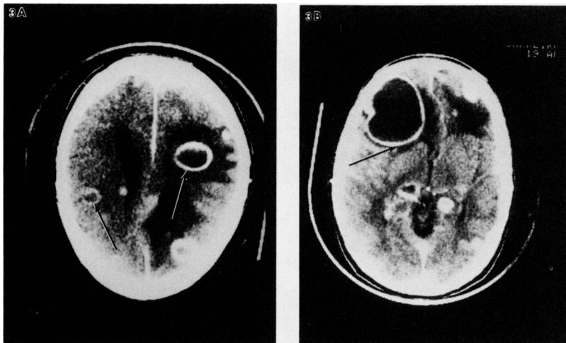
FIG. 3. CT scans obtained during evaluation of patient No. 2 for possible brain abscess. A. Ring-enhancing lesions (arrows) are clearly demonstrated. B. Large right-sided ring-enhancing lesion causing shift of brain contents leftward. At biopsy of this lesion infection was not encountered. Lesions proved to be metastatic in origin.

was made to aspirate the contents of the right frontal lesion; the material it contained was clear yellow fluid which had no foul odor. Gram stain showed only neutrophils and no organisms were seen.