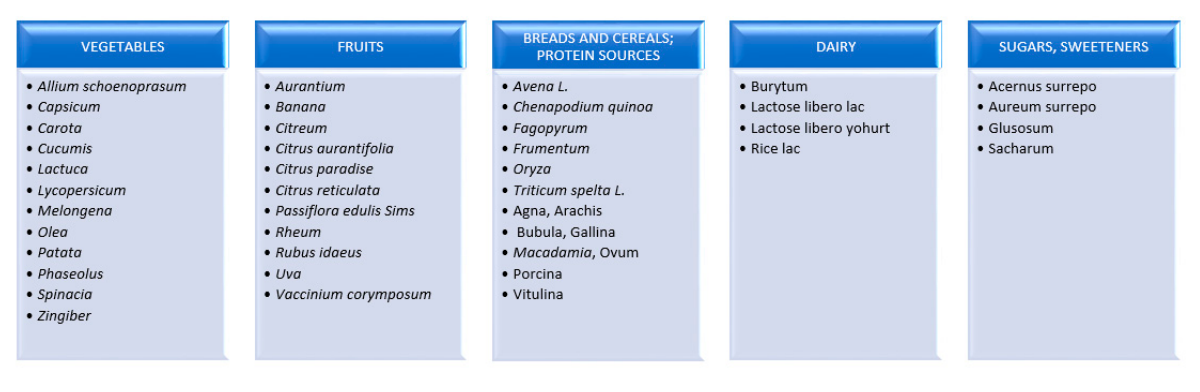
Figure 2. List of products low in FODMAPs.

Figure 1. List of products being the source of fermentable oligo-, di-, and mono-saccharides and polyols (FODMAPs).