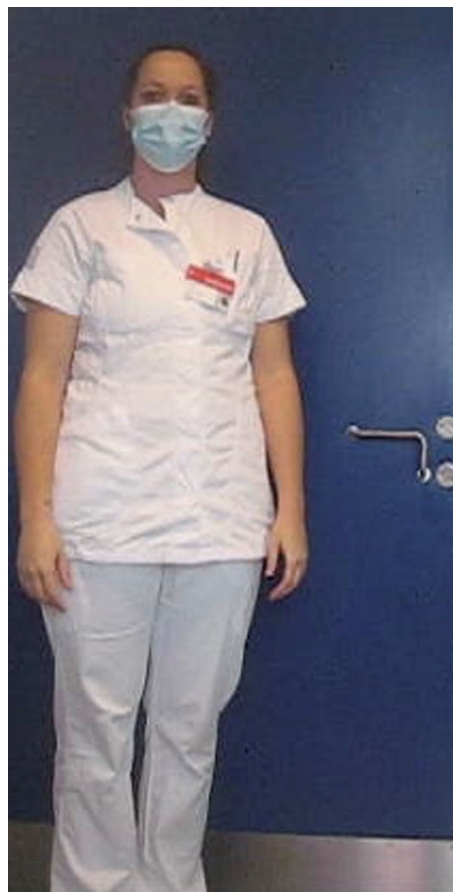
Figure 1. Surgical mask used as normal equipment on a working day.

Regarding the mask types, they have different protection efficiencies and breathability. N95 and FFP1, FFP2, and FFP3 are respirators. In Europe, FFP2 and FFP3 are available, in US N95. Other face masks are surgical masks (type II/IIR) (Fig. 1). FFP1 is the mask with the least filter capacity, since it can prevent 80% of particles greater than 0.3 \mu\text{m} . FFP2 and FFP3 are 94%, respectively, and