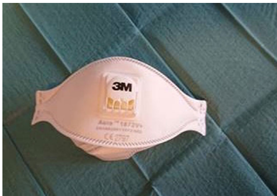
Figure 2. FFP3 mask.

Bearded employees in the hospital sector face problems, when using masks, since the seal is not complete. Removing the beard is not an option due to personal or religious reasons. In 2015, British Health and Safety Laboratory conducted a study for the Health and Safety Executive regarding the presence of stubble and the protection. In the report, they concluded that the protection could be significantly compromised, and as the growth of facial hair continues, the protection would be further reduced [70]. To solve this challenge, the Singh Thattha technique has been examined in a pilot study. This technique involves the use of an elastic rubber band beard cover, that is, tied around the turban and headcloth. The technique was tested by a qualitative fit test (QFT) and a quantitative fit test (QNFT). The qualitative method is composed of sensing a test agent such as bitter or sweet. The quantitative method is based on particle counting. The study comprises in the qualitative test 27 dentists, and 25 of whom were able to detect the agents, and in the quantitative test, 5 out of 5