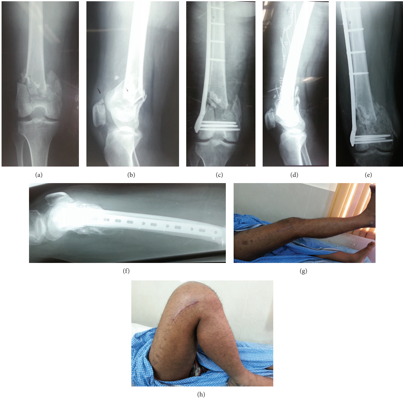
FIGURE 1: A 40-year-old male presented with an AO/OTA-type C2 supracondylar femoral fracture ((a) and (b)); the fracture was treated with AO distal femoral locking plate ((c) and (d)). The fracture healed with good alignment ((e) and (f)) with satisfactory knee movements ((g) and (h)).

incidence of varus/valgus deformity greater than 5 degrees [20]. Our relatively low incidence of deformity is probably because of improved surgical expertise along with better understanding of fracture anatomy.