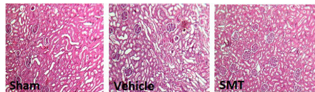
Figure 2. Sample images of kidney tissue in three experimental groups. Higher tissue damage was observed in the IR + SMT group.

2 hours of reperfusion increased NOS activity (39). Some evidence has shown excessive NO production during IRI is related to renal dysfunction (39,40). Administration of SMT promoted renal damage induced by IRI. Contrary to our findings, Guven et al showed that administration of SMT 6 hours prior to renal ischemia followed by 6 hours of reperfusion ameliorated renal dysfunction (33). This contrast may be related to the different protocols used. Although reperfusion is necessary for survival in ischemic kidney, it leads to further injury in the tissue (41,42) probably due to distribution of harmful metabolites (4,43). In the present study, renal reperfusion was achieved for 24 hours that may lead to further injury. Administration of SMT increased lipid peroxidation and hepatic injury, however, it seems that NO has cytoprotective and cytotoxic roles. For example, L-Arg as the NO donor ameliorates cisplatin-induced nephrotoxicity in male rats (44,45), and S-Nitroso-N-acetylpenicillamine (SNAP) as another NO donor abolished hepatic injury (45) while L-NAME as the NO inhibitor accelerated nephrotoxicity induced by cisplatin (46). Inhibition of NO by SMT reduced renal dysfunction induced by IRI (33). Hsu et al reported the protective effect of iNOS in hepatic IRI, which was proved via NO donor effect on increment of iNOS activity and consequent decrement of MDA level (45). It seems that in our study, SMT inhibited beneficial effect of iNOS. On the other hand, in this study, despite