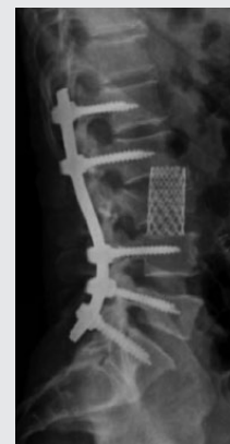
Fig. 6 Standing post-operative radiograph following posterior-anterior approach.