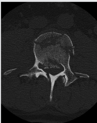
Fig. 2 Level III axial view.