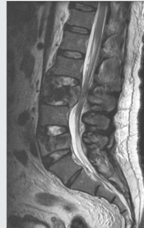
Fig 4 MRI scan sagittal view with intact posterior ligamentous complex.