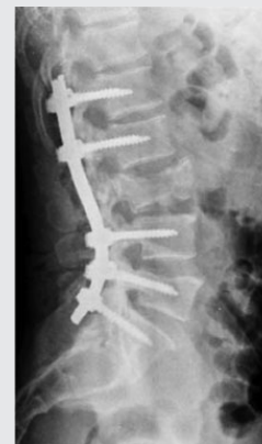
Fig. 5 Standing post-operative radiograph following posterior approach.