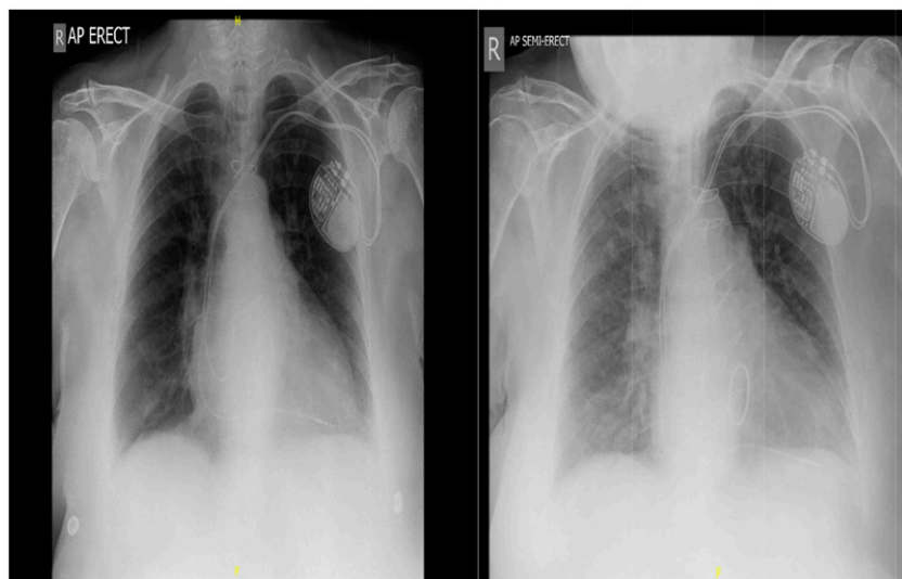
Figure 2. Chest X-ray: (a) at admission and (b) 11 days after index procedure showing features of viral pneumonitis.

CRP: C-reactive protein; WCC: white cell count ( \times 10^9 cells/litre).