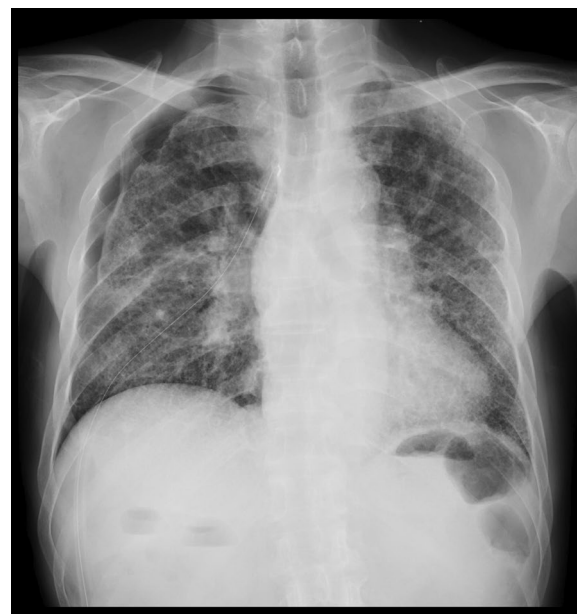
Fig. 2 Preoperative chest X-ray showing incomplete expansion of the right lung