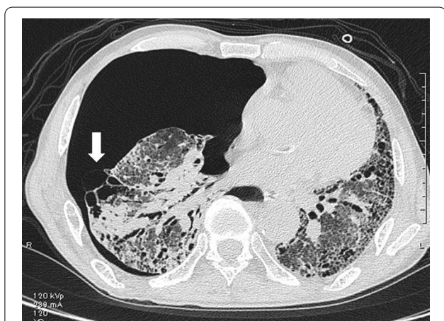
Fig. 1 Computed tomography at the onset of pneumothorax showing cystic lesions in the fissure between the right middle and lower lobes (arrow)

A 75-year-old man with idiopathic pulmonary fibrosis who had been on home oxygen therapy was referred to our department for the treatment of right spontaneous pneumothorax. Chest computed tomography showed cystic lesions in the fissure between the right middle and lower lobes (Fig. 1). Chest tube drainage was immediately performed. Although he underwent pleurodesis with autologous blood, moderate air leakage persisted and lung expansion was incomplete (Fig. 2). His oxygenation deteriorated due to pneumothorax. Percutaneous oxygen saturation was 96% with an oxygen conserving device, Oxymizer F-224 (CHAD Therapeutics, California, USA), with oxygen at 6 L/min. Non-intubated VATS under local anesthesia was performed 8 days after the onset of pneumothorax. He was placed in the supine position while breathing spontaneously. Oxygen was administered via an HFNC (Optiflow, Fisher & Paykel Healthcare, Auckland, New Zealand) with 60% inspired oxygen at a flow rate of 60 L/min. Fentanyl and midazolam were administered intravenously for analgesia and mild sedation, respectively. After local anesthesia using 1% lidocaine, an air-locking port for single-incision surgery, GelPOINT Mini (Applied Medical, California, USA), was positioned in a 3-cm incision in the fifth intercostal space