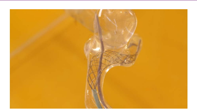
Figure 1 Demonstrates the compliant mesh of Comaneci in a broad-based aneurysm model.

included. Exclusion criteria for the treatment with the Comaneci device were a previous stent implantation in the target vascular territory; a bifurcation-type aneurysm; fusiform shape; or extradural location of the aneurysm.