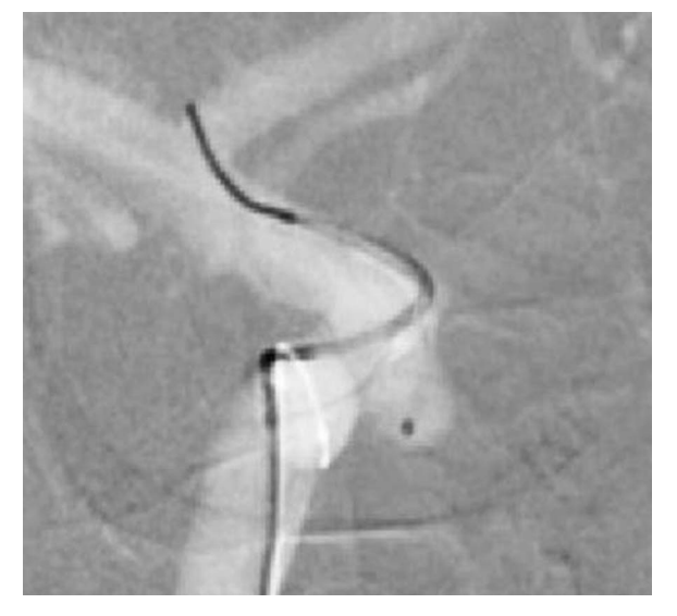
Figure 3 Insufficient coverage of a small internal carotid artery (ICA) paraophthalmic aneurysm owing to an incomplete expansion of the Comaneci device possibly caused by the highly curved segment of the ICA; the treatment strategy was changed to stent-assisted coiling; right anterior-oblique view.

blocked flow within the parent artery during expansion of the device. Once the Comaneci covers the aneurysm orifice sufficiently, no further deflation and inflation maneuvers are required, and this can reduce the risk of vessel injuries. The overall remodeling capability of the device, compared with a