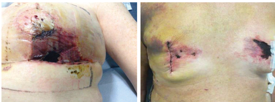
Fig. 2. Examples of wound breakdown where PICO was not used.

As highlighted, IBR implant infection rates compare badly with other implanted medical devices. It should be noted that these are performed in slightly different contexts, with complete sterility in orthopedic or cardiac device implantation in contrast to reconstructive breast surgery, which involves dissection through bacterially contaminated ductal breast tissue. Thus, NPWT will have a significant role to play in reducing the rates of wound breakdown or skin flap necrosis that could provide a potential portal of entry for bacteria to colonize the implant and result in implant loss. However, NPWT will not have any impact on any source of infection happening at the time of placing of the implant. Indeed, a recent review highlighted the various techniques used in the United Kingdom to try and reduce the rates of implant loss and assessed the levels of