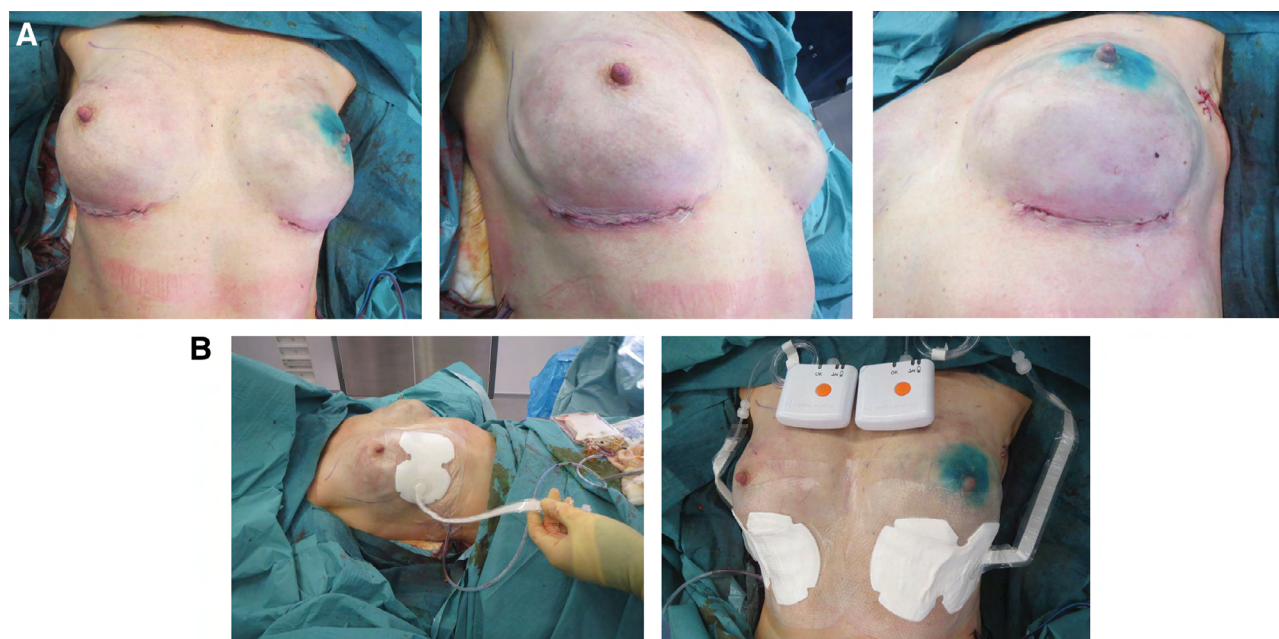
Fig. 1. Application of PICO dressing in theater. A, Immediately postoperatively. B, PICO application in theater.

from National Health Service Supply Chain; we averaged the unit cost across the sizes of PICO and assumed that 1 NPWT system was used per incision.