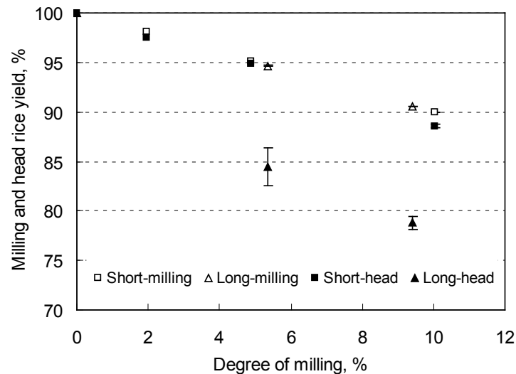
Figure 2. Effect of degree of milling on milling and head rice yield [65].