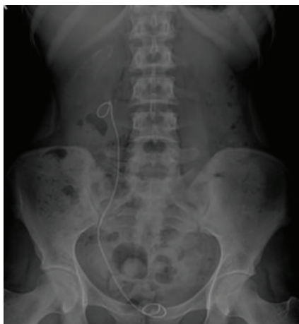
FIGURE 3: The right kidney was stone-free and perirenal collection of stone fragments was visible on kidney, ureter, and bladder X-ray after the second operation.

undesired effect. More effective drainage methods, without being more invasive, can make micro-PNL method safer and more preferable.