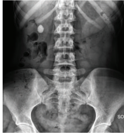
FIGURE 1: Preoperative kidney, ureter, and bladder X-ray of patient.