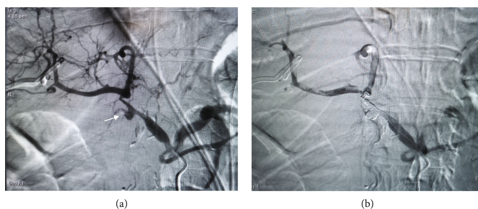
FIGURE 2: Endovascular treatment of late postpancreaticoduodenectomy hemorrhage. A 64-year-old man with hemorrhage through surgical drain 30 days after surgery: (a) selective celiac axis arteriography revealed a pseudoaneurysm that occurred in the stump of the gastroduodenal artery (arrow) and (b) reangiography showed that the pseudoaneurysm was occluded by coil embolization. The patient was discharged from the hospital 15 days after endovascular treatment, without suffering from rebleeding and any severe procedure-related complication during 1 year of follow-up.

safety of early angiography and endovascular treatment and recommended it as the procedure of choice, noting that surgery should be the primary treatment only where IR is not available or where patients cannot be stabilized for an inter-