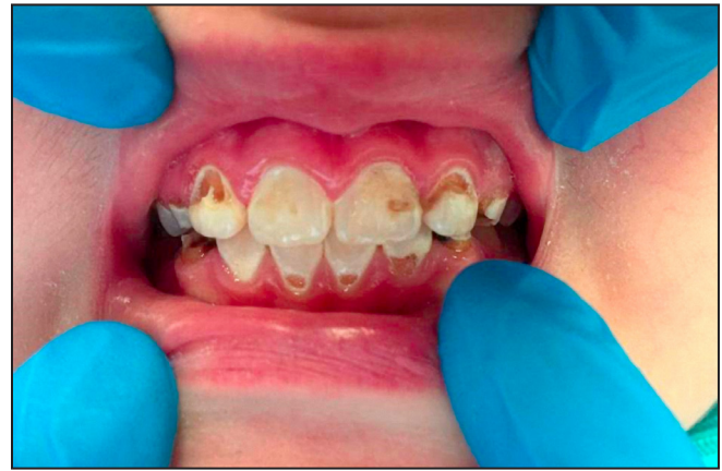
Figure 1. The condition of patient's anterior teeth during the first visit.

Oral examination showed better oral hygiene, reduced visible plaque and slight redness of the gums.