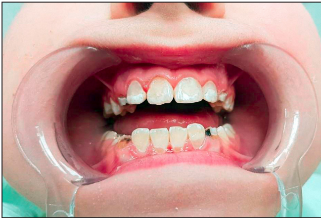
Figure 3. Teeth after restorations.

that had fallen out, but he did not mention any pain (Figure 4). The patient claimed that he had been brushing teeth 2 times a day, but he could not specify the toothpaste he had been using. The patient did not take any other oral hygiene measures. His diet was irregular.