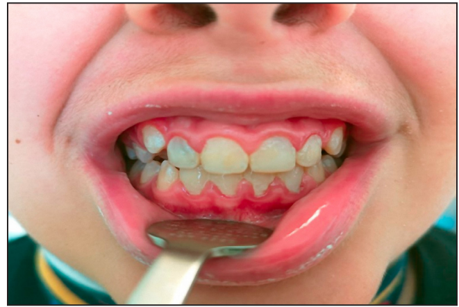
Figure 5. Patient's oral hygiene condition.

The main measure to stabilise the condition is the elimination of etiological factors. Radiation caries is not primarily caused by the effect of radiotherapy; however, it can still influence the development of caries. The main etiological factor in the development of caries is the dental biofilm [3]. In our case, we think that the patient and his parents were not motivated to follow the dentist's instructions of oral hygiene. The OHI-S did not improve enough during the treatment. Even though conversations about motivation, oral hygiene instructions and oral care product recommendations were conducted by the dentist during every appointment, the results were poor. Besides, chronic gingivitis was diagnosed during the first visit due to inadequate oral hygiene and it did