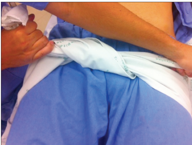
Figure 4: A circumferential pelvic binder was applied at the great trochanter level to perform pelvic ring closure

Although some authors advocate that a gap >1.0 cm with concomitant anterior ligaments disruption is pathological and provides pelvis instability, the standard treatment for anteroposterior compression Type I (pubic symphysis diastasis <2.5 cm) remains conservative. Bed rest until pain relief and progressive weight bearing after at least 4 weeks are indicated. [15] In addition, postpartum pubic symphysis disruption with <4.0 cm tends toward original