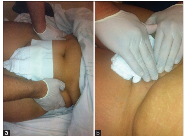
Figure 1: (a) Iliac crest compression to verify pelvic ring stability. (b) Pubic symphysis palpation investigating for diastasis between pubic rami

Injury mechanism of intrapartum pubic symphysis disruption is a rapid and forceful descendent pressure of the fetal head