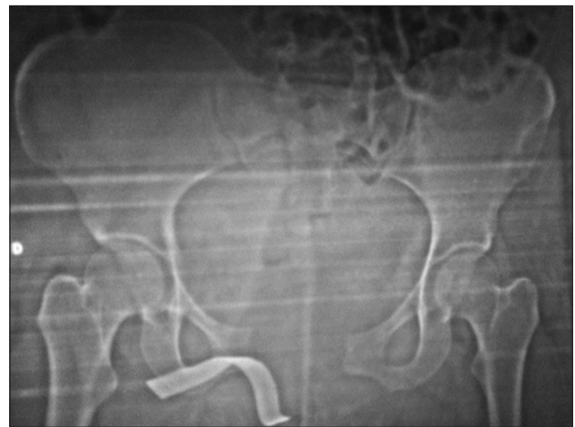
Figure 2: Pelvic X-ray in anteroposterior view showing the pubic symphysis disruption with 8cm widening. There were no sacroiliac joints widening and vertical instability