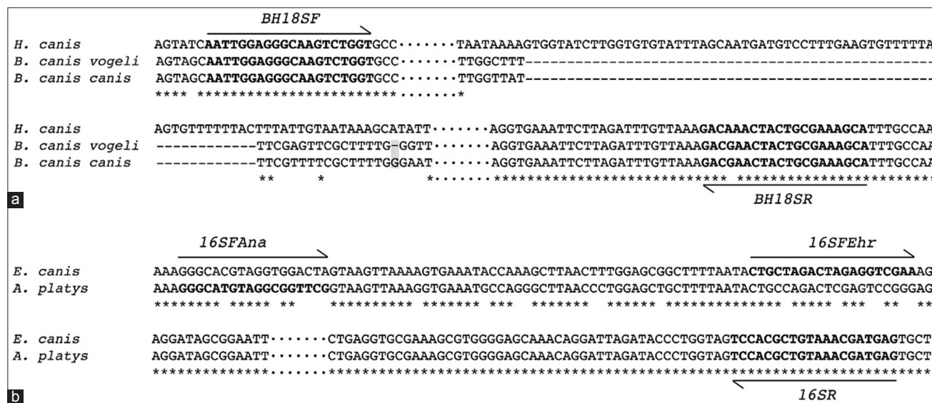
Figure-1: Simplified DNA alignment showing polymorphic regions targeted in primer design of (a) 18S rDNA and (b) 16S rDNA. Dot symbols show omitted regions that may not be involved in the result interpretation and discussion. Shaded area shows the 1-bp insertion between Babesia canis subspecies.

Out of the 49 dogs, only 2.04% (1 dog) was observed as positive for H. canis infection, which was identified using Giemsa-stained blood smear examination under a light microscope. On the other hand, the PCR results showed that 57.14% (28/49) of dogs were positive for at least one blood parasite infection and the greatest prevalence was with E. canis corresponding to 36.73% (18/49) with lower values for A. platys , H. canis , and B. canis infection with the prevalence scores of 30.61% (15/49), 4.08% (2/49), and 2.04% (1/49) of dogs, respectively. Examples of successfully amplified DNA bands are shown in Figure-2a-d, respectively, at 356 bp for B. canis , 409