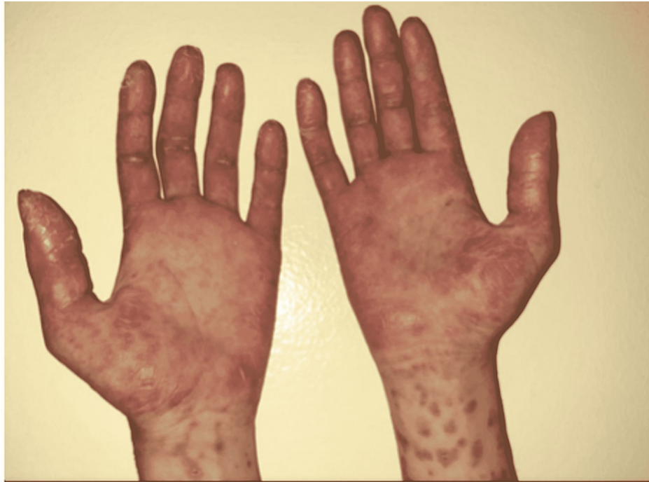
FIGURE 3: Cutaneous vasculitis located in the palmar regions of our patient.

The autoimmune assessment showed anti-nuclear antibodies greater than 1:1,280 with native anti-DNA antibodies at 210 UI/mL ( N < 10 ), positive anti-SM Abs, and C3/C4 fractions consumed. Anti-cardiolipin, anti-beta2GP1, and lupus anticoagulant antibodies were negative. Endomyocardial biopsy was discussed but not performed after weighing risks and benefits for the patient in a multidisciplinary meeting. The diagnosis of lupus myopericarditis complicated by cardiogenic shock was made, in addition to renal involvement. In addition to the medical treatment of heart failure associated with pericardiocentesis for the pericardial effusion, a treatment was started with methylprednisolone at 1 g/day for three days and then prednisolone at 1 mg/kg/day, combined with mycophenolate mofetil at a rate of 2 g/day and hydroxychloroquine. On day 15, the left ventricular ejection fraction improved to 45-50%, and the patient showed good clinical improvement, and her heart failure and lupus signs improved.