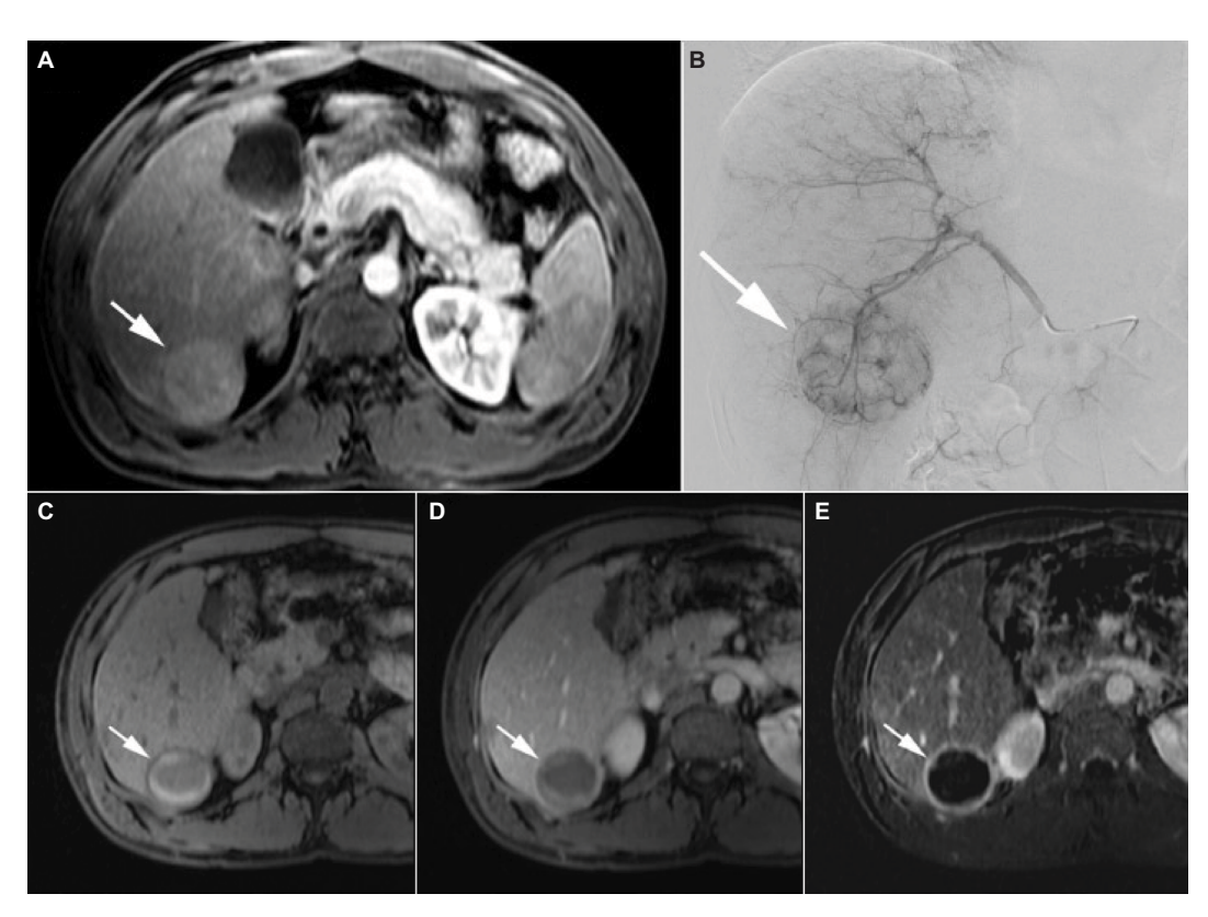
Figure I TACE

Stratification of patients diagnosed with HCC into groups is the primary aim of staging systems. Staging systems will assist