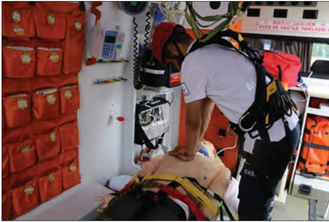
Figure 1: Application of chest compressions to the training model in an ambulance by paramedics and the safety measures taken

ambulance (Mercedes Sprinter®, 2015, Germany) from the EMS of Ankara city was used. To ensure standardization, the ambulance was driven by the same ambulance driving trainer each time. Before the start, the driver was allowed to take five practice laps to get used to the driving track. During the study, the drivers were asked to go as fast as they could, but they reached a maximum speed of 40 km/h to ensure ambulance paramedics safety. The speed was up to 40 km/h on the straight-ahead route, while the maximum speed was 20 km/h in the maneuvering areas.