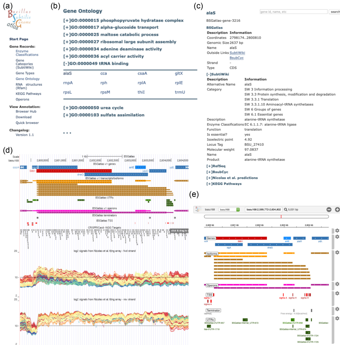
Fig. 3. Illustration of the BSGatlas and its features. (a) The BSGatlas start page provides the main groups of navigational entries that lead to either the gene records, the search function or the various visualization options. (b) The gene record pages have the same structure across each classification system, these are gene types, enzyme classes or functional classification as listed in SubtiWiki or GO terms (a subset is shown in the figure). Each group is shown as a clickable entry, which list its associated genes. The gene names are shown as links to (c) detailed description pages. These show all meta-information we found for all genes and all other annotated entries, such as transcripts and operons. (d) UCSC genome browser. The user has the option to directly show the BSGatlas annotation as an assembly hub in the UCSC browser. Thus, they can also show their data, e.g. an RNA-seq experiment, right next to the annotation. Underneath the UCSC browser panel, a user can control details of what parts of the BSGatlas are shown. In addition, this includes the gene coordinates as they were originally annotated, which allows a closer investigation of the gene merging process. Here, a user can also opt-in to show the predicted CRISPR-Cas9 gRNAs and the signals from the tiling-array study. A click on the individual tracks shows more in-depth information on the guides and the tiling array colouration. (e) Quick browser. We provide a fast visualization directly on the BSGatlas main page, which allows a user to get a quick overview of the annotation without the need to leave the webpage. A click on any BSGatlas annotation redirects to the corresponding description page. (The browser is available at http://rth.dk/resources/bsgatlas/ ).

our CRISPRspec pipeline identified 378050 guide sequences of 23 nt lengths (including PAM sequences). We only predict guides with NGG PAMs, but also consider off-targets with other PAMs (NGG, NAG and NGA). The specificity prediction indicates that 1792 gRNA have multiple on-target regions