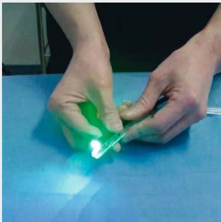
► Video 1 Esophageal clearance technique.

Fifty-six patients underwent POEM from April to November 2016. Of them, 11 patients with achalasia were enrolled in this study and underwent this novel method of esophageal clearance. Patient characteristics are shown in ► Table 1. Median age of the patients (range) was 47 (27–76) years, and the study population consisted of 6 male and 5 female patients. Median duration of achalasia symptoms (range) was 12 (0.2–30) years. The median body mass index (range) was 21.3 (15.6–32.7) kg/m 2 . The degree of esophageal dilatation was grade I in one patient (9.1%) and grade II in 10 patients (90.1%). The type of achalasia was non-sigmoid in 5 patients