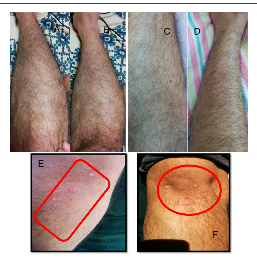
Figure 4 Images of patient's limbs after Hijamah treatment showing the absence of psoriatic lesion except on elbow. (A) Right leg (near the knee); (B) Left leg (near the knee); (C) Lower right leg; (D) Left lower leg; (E) Left elbow; and (F) Right elbow.