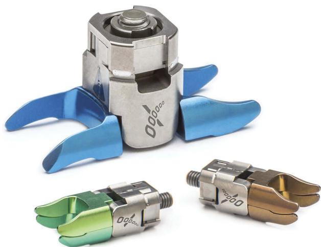
Figure 1 Superior ® indirect decompression system. Note: Image courtesy of Vertiflex, Inc.