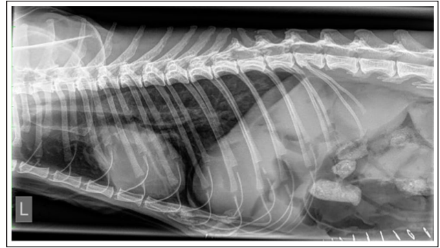
Figure 2 Postoperative left lateral thoracic radiograph. No esophageal distension is visible; the gas-filled structure in the caudodorsal thorax is no longer visible. Note free gas in the peritoneal space secondary to surgery

Postoperatively, the cat was hospitalized for 10 days with the gastrotomy tube in place. However, during this time the tube was not used, as the cat started eating well, with no further vomiting.