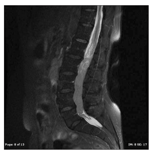
Figure 1: Sagittal T2-weighted image flair sequence L-spine