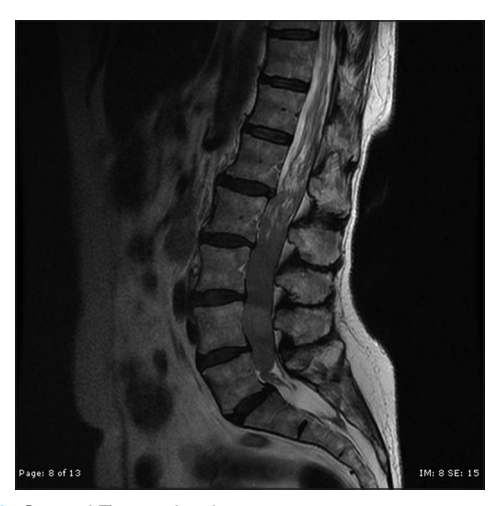
Figure 2: Sagittal T2-weighted image