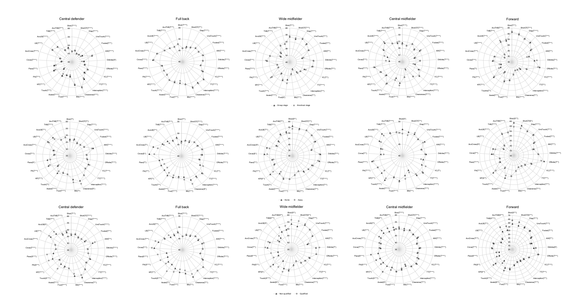
Figure 1. Cont.