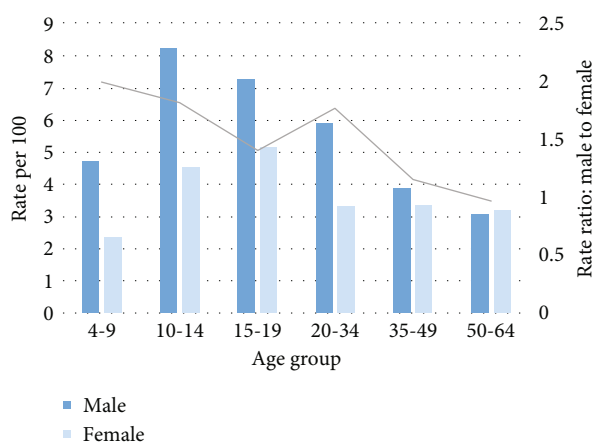
FIGURE 1: Rate of ADHD according to age and sex.

† Adjusted for the other variables in the model.