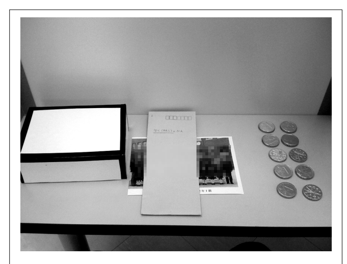
FIGURE 1 | Photograph of the top of a desk in the private condition (left, box with lid for the recipients' chocolates; center, envelope for the child's own chocolates and image of classmates; right, 10 chocolates).

Children were told that, if they wanted to give the chocolates to a recipient, they should put the chocolates into the box, but if they wanted to keep the chocolates for themselves, that they should put them into the envelope.