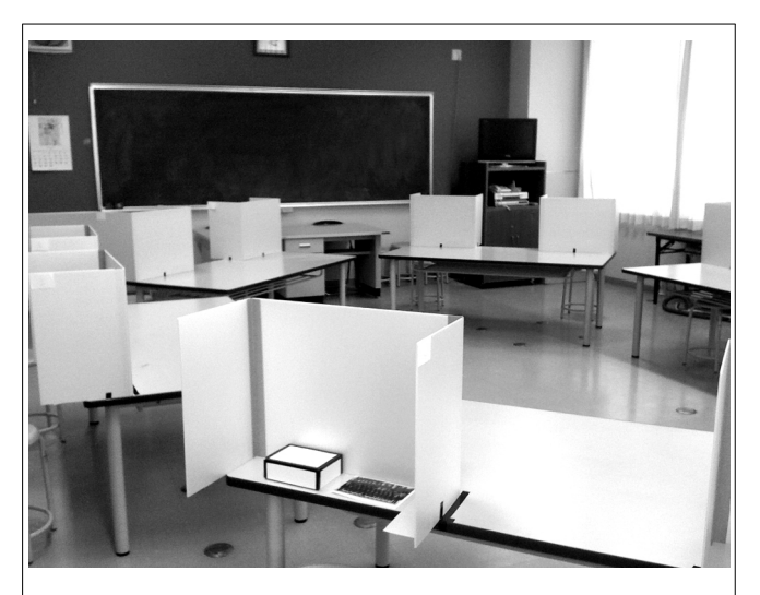
FIGURE 2 | Photograph of the experimental environment in the private condition. In the public condition, the vertical plastic boards and the lids of the boxes were removed.

The mean allocations by sex and grade in each condition are presented in Figure 3 . A 5 × 2 × 2 Grade [(2, 3, 4, 5, and 6) × Sex (girl = 0, boy = 1)] × Condition (private = 0, public = 1) three-way analysis of variance (ANOVA) on the allocations revealed significant main effects of grade, F(4, 100) = 8.44, p < 0.001, \eta_p^2 = 0.252 , condition, F(1, 100) = 12.41, p = 0.001, \eta_p^2 = 0.11 , sex, F(1, 100) = 6.13, p = 0.015, \eta_p^2 = 0.058 , and a significant three-way interaction (grade × sex × condition), F(4, 100) = 4.28, p = 0.003, \eta_p^2 = 0.146 .