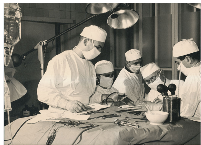
Fig. 5 Hugo Krayenbühl (second from the right, wearing glasses) operating. B/w print on carton. Neurochirurgie Kantonsspital, 1970s. Published with permission