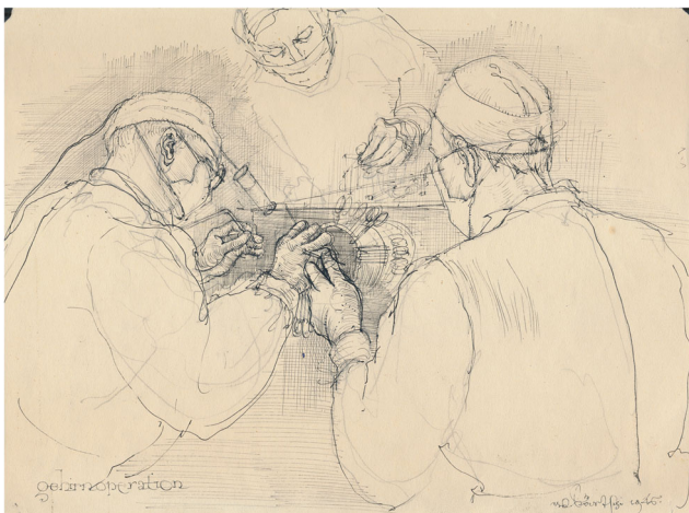
Fig. 4 Hugo Krayenbühl operates on the brain ( gehirnoperation = brain surgery), assisted by two colleagues. For illumination, he often wore a headlamp with power connection, springy metal-buckle and padding, that he had brought from London. Pencil and ink painting. Artist: Werner Bärtschi, 1946. Photo credit: Archiv für Medizingeschichte Universität Zürich (AfMZH) Bsc 7–1 . Published with permission

end of 1937, a total of 60 patients had been hospitalised in the new neurosurgical unit, including 25 patients with brain tumours, of which 18 were treated surgically [99]. Lumbar disc surgery was also performed on a regular basis from 1938 [72]. From the 1940s onward and for operations in the prone position (posterior approach to the spine, cerebellar operations) in particular, Krayenbühl used the technique of endotracheal intubation. It is reported that he preferred to operate at night, as there were fewer distractions [33], and with the assistance of general surgeons or medical students that he selected during his lectures [99]. He demanded that at the time of surgery, all relevant patient information was summarised on a red piece of paper that he considered an essential part of the patient file, attesting to his well-organised character. The chosen surgical