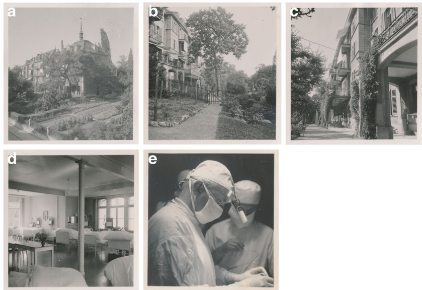
Fig. 3 The first department of neurosurgery was situated in the Aussenstation Hegibach from 1937 to 1951. a View from the Heliosstrasse. b Outside view with garden. c Outside view near entrance. d Inside view depicting the patient dormitory. e Hugo Krayenbühl and Gerhard Weber operating. Series of eight b/w prints on carton (only five shown). Pressedokumentation , photographer unknown. Zurich, 1949. Photo credit: Archiv für Medizingeschichte Universität Zürich (AfMZH) PS_gf IN 37.01:002 . Published with permission

and injecting personal funds (Fig. 3a–d) [33, 99, 113]. Krayenbühl provided surgical instruments that he had bought in London, such as a surgical headlamp (Figs. 3e and 4), retractor, tweezers, chisel, flexible spatulas, Pennybacker bone rongeur, nerve root hooks and angled scissors (Fig. 5). The Rockefeller foundation donated an X-ray machine. The first intervention was a ventriculography performed on a 34-year-old man on 13 July 1937. Krayenbühl operated on the first brain tumour patient with the independent unit (a 37-year-old woman with sphenoid ridge meningioma) on 19 July 1937. This intervention took almost 9 h. It was performed under local anaesthesia. The long-term follow-up indicated that the patient was in good health for 30 years [33]. By the