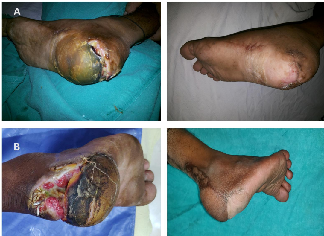
Fig. 2: A. Pre- and Post-operative image of posterior heel defect with avulsion component managed with advancement of avulsed heel. B. Posterior heel defect extending up to Achilles tendon region covered with the islanded RSA flap