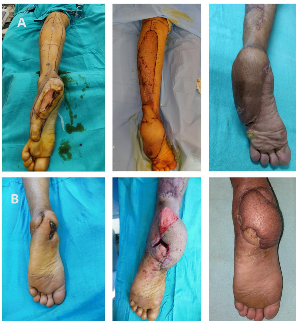
Fig. 4: A. Posttraumatic complete heel defect at the lateral border of the left sole of size 8 cm x 4 cm size with surrounding scarring and marking extended RSA flap up to 4 cm proximal to the popliteal crease (Left side), Exteriorization of pedicle and reach of the flap up to the midfoot (Middle), 1-month follow-up showing 16 cm x 8 cm size flap (Right side). B. Post-traumatic defect at the left heel with the exposed calcaneum (Left side), In second after pedicle division de-epithelized part of the pedicle used for filling the bony cavity (Middle), 2 months follow-up showing complete healing (Right side)

Society (AOFAS) hindfoot clinical ratings scale (Table 1) 10,15,16 . The sensation was objectively assessed by using the Semmes-Weinstein monofilament test at the flap site, with 3 different monofilament sizes (size 6.65=300 g for deep sensation, size 4.31=2 g for protective sensation, and size 3.61=0.4 g for normal touch sensation) 10,17 . Soft tissue breakdown was noted clinically to assess the durability of the flap.