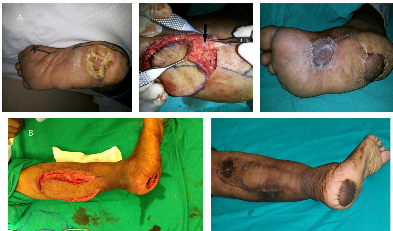
Fig. 3: A. Neuropathic ulcer at right anterior heel (Left side), Black arrow indicate a subcutaneous vascular bundle of a medial plantar artery proximal to the flap (Middle), 2 months follow-up showing well-settled MPA flap and skin graft (Right side). B. Neuropathic ulcer of 4 cm x 4 cm size at the right anterior heel with elevated extended RSA flap (Left side), 3 months follow-up showing the well-settled flap (Right side)

component and posterior defects extending up to the Achilles tendon region were covered by conventional islanded reverse sural artery flap with a pedicle width of four cm (Figure 2B). Extended RSA flap cover was accomplished in two stages with the exteriorization of the fasciocutaneous pedicle as described by 14 under spinal block anaesthesia with tourniquet control. In the first stage, the flap was marked over the upper third of the calf with a maximum upper limit of 4-5 cm distal to the popliteal crease. Flap elevated deep to fascia from proximal to distal including short saphenous vein and sural nerve. The pivot point of the flap was kept at five cm proximal to the tip of the lateral malleolus and the width of the fasciocutaneous pedicle was maintained around five cm between the posterior border of the fibula and midline of the Achilles tendon. The flap elevated and the defect was covered as an Interpositional flap. Donor sites were covered with a split-thickness skin graft. Immobilization of ankle joint done with a dorsal splint till flap division. The patient was kept in a contralateral decubitus position to avoid compression at the pedicle site.