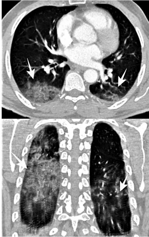
Figure 1 - Chest tomography scans obtained on the second day of hospitalization, showing ground glass opacities (white arrows) in both lungs, suggestive of alveolar hemorrhage.

remission of symptoms and normalization of laboratory parameters.