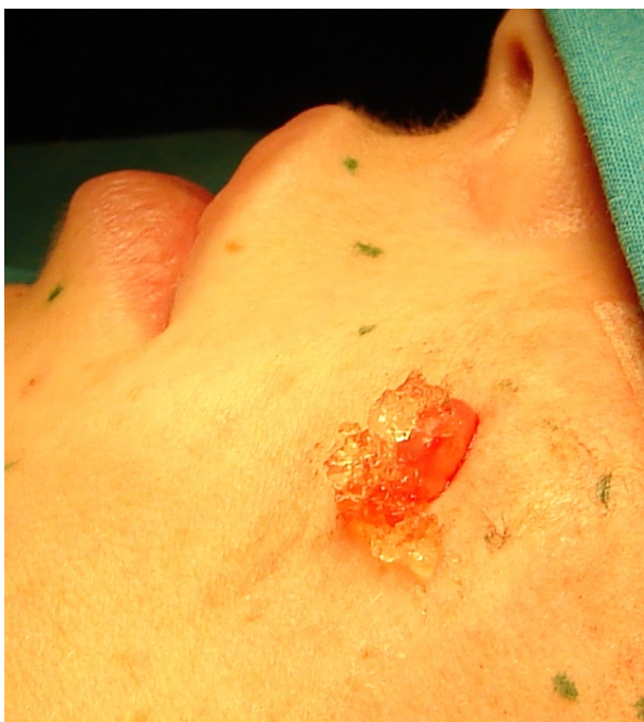
Figure 2 The cystic lesion filled with a gelatinous material was removed.

The cyst in the zygomatic region is the element of a seemingly obvious relationship: its formation was attrib-