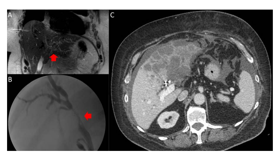
FIG. 2. MRI and ERCP images. (A) Coronal T2 MRI demonstrating an ill-defined 4.0 \times 2.9 -cm hypo-enhancing lesion in segment III (red arrow) causing obstruction of the intrahepatic biliary ducts (left greater than right). Additionally, there were several hypo-enhancing satellite lesions in segment II, II, and IVb. (B) Second ERCP with biliary stricture at the bifurcation (red arrow). A plastic biliary was subsequently placed. (C) Axial and coronal images of CT abdomen 5 months after presentation. Bilobar low-density hepatic masses, loculated ascites, and peritoneal nodular enhancement adjacent to the left hepatic lobe. Abbreviation: MRI, magnetic resonance imaging.