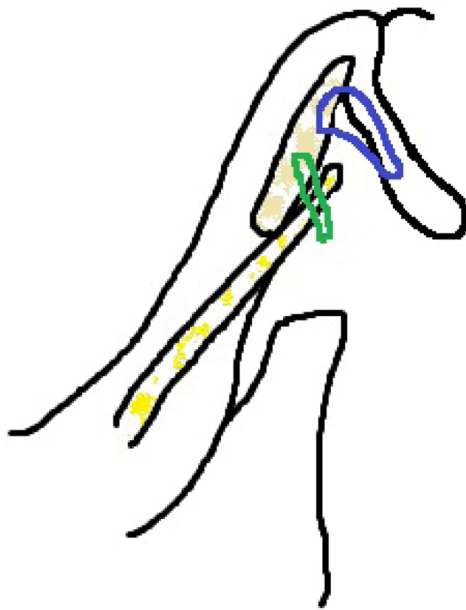
Figure 2 A simple diagram of the lower eyelid and our combination procedure. Notes: The pink round structure represents the tarsus, and the thin yellow structure represents the capsulopalpebral fascia (CPF). The green circle shows the binding location of the CPF and the tarsus. The blue circle shows the ciliary everted suture, which ties the dermis to the tarsus.