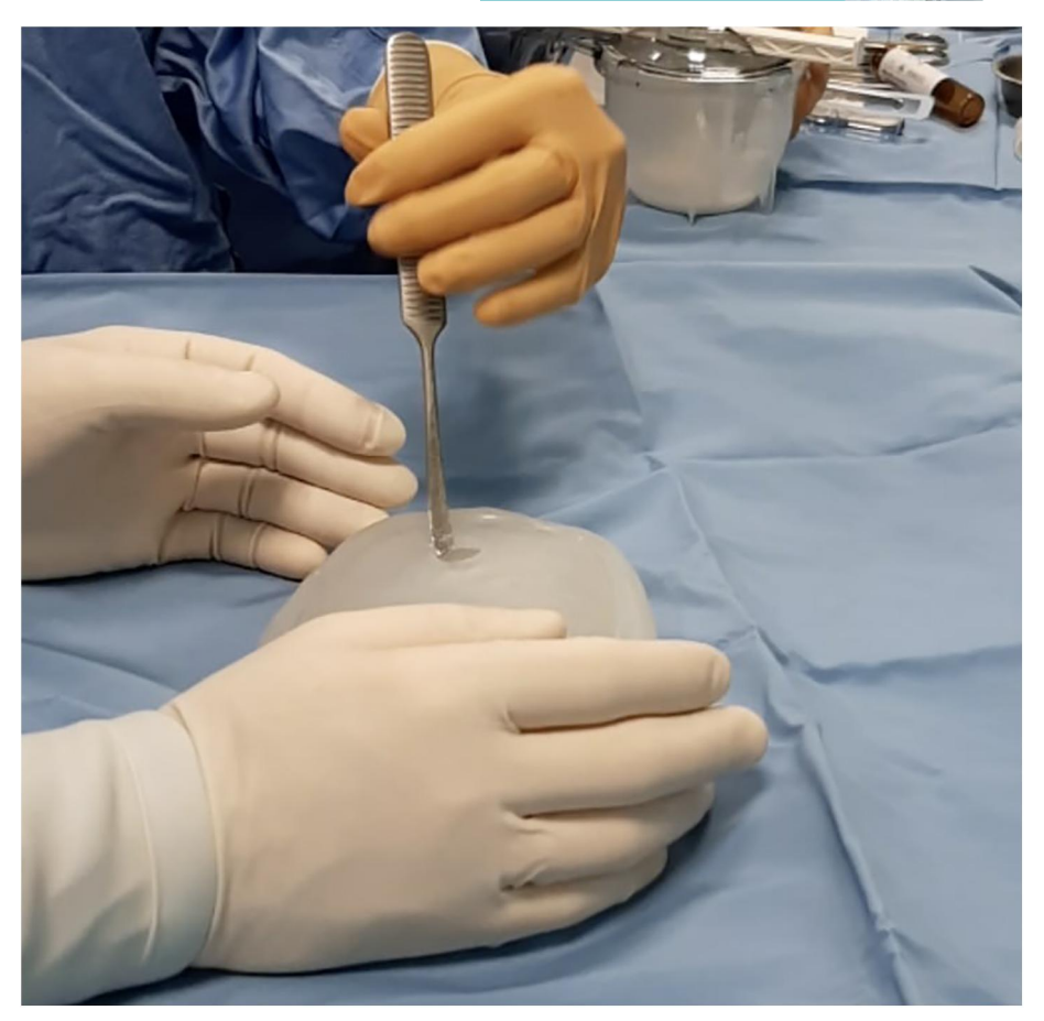
FIGURE 1 The silicone moulds is unpacked and assembled. From the central hole the inferior part is lowered with a dissector to pour the liquid Polymethyl methacrylate