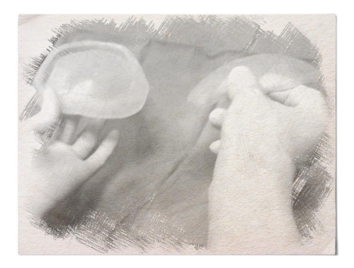
FIGURE 3 Drawing showing mould system

5) it is easily available and tested for medical procedures; Other materials require an adjuvant non-stick layer such as vaseline<sup>9</sup> or silicone.<sup>8</sup>