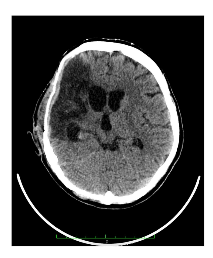
FIGURE 5 Post-operative head CT scan showing the correct placement of the cranioplasty

We believe using the assembled mould would reduce the border imperfections you can have performing the procedure in two steps. Moreover, rigid moulds are more difficult to detach from the cranioplasty with a higher risk of damage for the prosthesis.