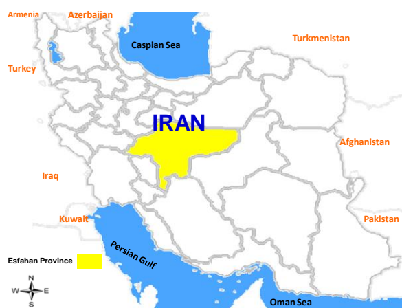
Fig. 1. The geographical situation of Isfahan Province in Iran