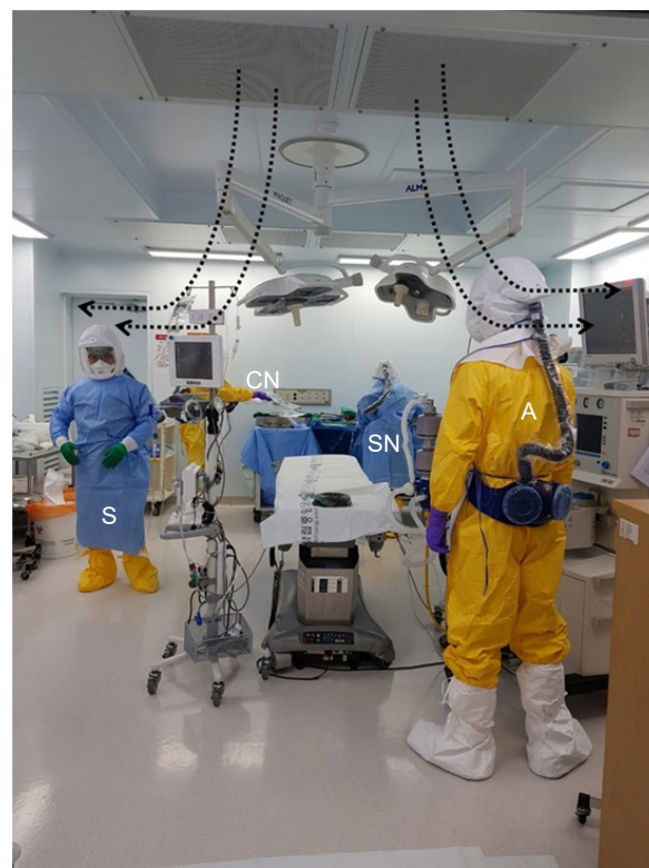
Fig. 2. Medical staff in preparation for surgery. The medical staff who were going to be inside the operating room each wore a fluid-resistant gown, PAPR, gloves, boots, and an apron. Staff wore double layers of gloves and boots. The surgeon and scrub nurse wore sterile gowns and surgical gloves on top of the PPE. The surgeons in the picture wore N95 masks inside the PAPR hoods. There is no strong evidence for the added protective effects of the concurrent use of N95 masks with PAPR [4]. Laminar flows from the ceiling toward the operating field (dotted arrow). A: anesthesiologist, S: surgeon, SN: scrub nurse, CN: circulating nurse, PAPR: powered air-purifying respirator, PPE: personal protective equipment.

Invasive arterial blood pressure (ABP), ECG, heart rate, SpO 2 , and bispectral index monitoring were commenced in the operating room; the patient's vital signs were stable. After clamping the endotracheal tube, the tube was detached from the portable ventilator and connected to the anesthesia machine, which had a HEPA filter in the expiratory circuit, and end-tidal carbon dioxide monitoring was started. General anesthesia was induced by 0.5 mg/kg