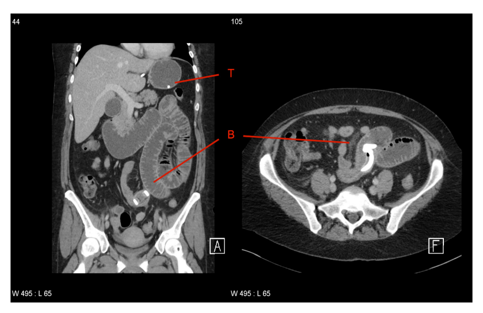
Figure 2 CT scan of abdomen and pelvic on admission; line B indicates laparoscopic adjustable gastric band in lumen of small bowel; line T indicates tip of connecting tube on gastric fundus.

marked dilatation of the stomach, duodenum, jejunum and proximal ileal loops which were fluid filled (figure 2). A transition point indicating mechanical obstruction was identified in midline at the level of pelvic brim where there was the dislodged gastric band with attached tubing within the lumen of a loop of ileum. Bowel distal to the point of obstruction was collapsed as expected. The gastric band access port was at its normal position in the anterior subcutaneous tissues and the tip of the fractured connecting tube passed through the gastric wall at the lesser curvature just below the gastro-oesophageal junction and was located within the gastric fundus (figure 2). There was no focal collection adjacent to the stomach at the site of tubing perforation. Only a small amount of free fluid was present in the pelvis and there was no pneumoperitoneum.