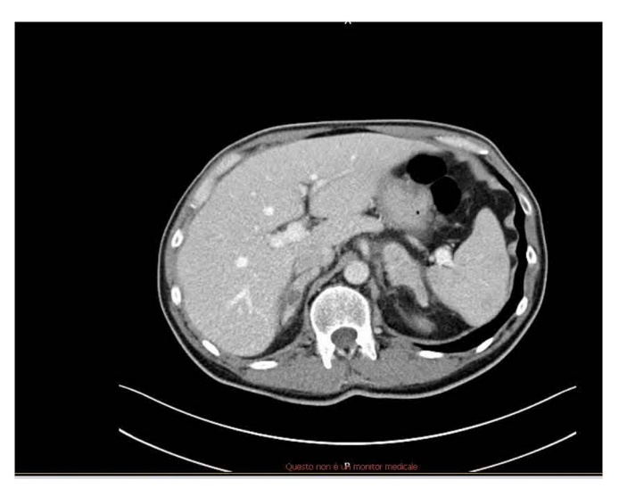
Fig. 3. The CT abdomen on chemotherapy showing left adrenal metastasis.

EUS-B was first described in 2009. EUS-B-FNAC broadens the