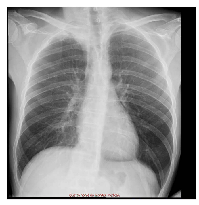
Fig. 1. Chest radiograph (PA) view showing a lesion in right apical region.

lesions had remained same in size, earlier result did not yield good tissue and adrenal metastasis versus metachronous primary was a dilemma, a left adrenal biopsy was performed with EUS-B (Fig. 4, video). The biopsy confirmed squamous cell carcinoma with Napsin-, CK +, p63 + and had PDL1 -5%, EGFR-wild type. There were no post-procedure complications. The therapy was switched over to Pembrolizumab.