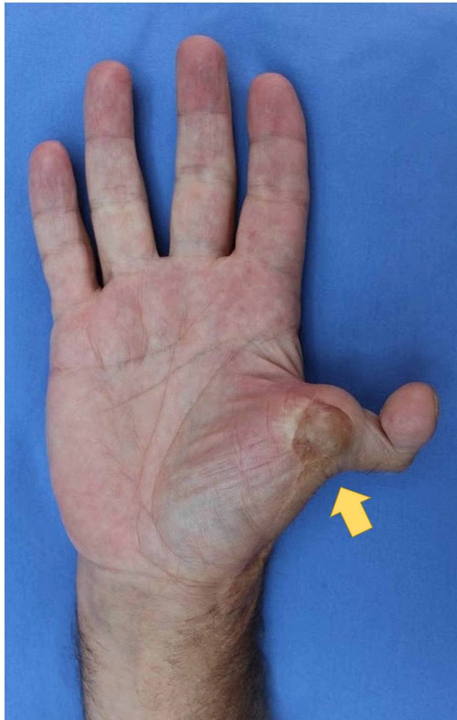
FIGURE 3: The ventral surface of the right hand, demonstrating the ventral aspect of the neothumb