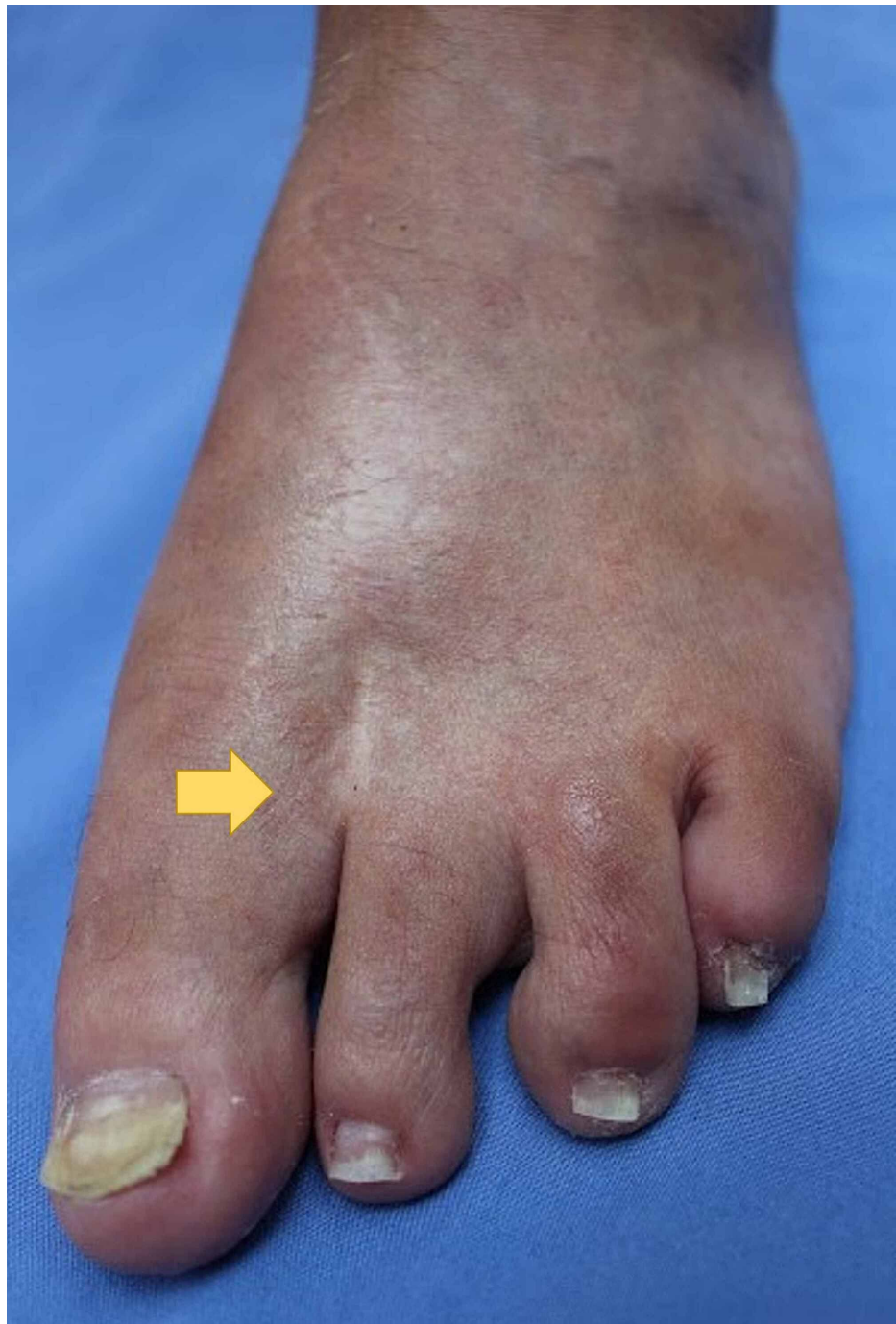
FIGURE 6: The patient's right foot, showing the index toe removed