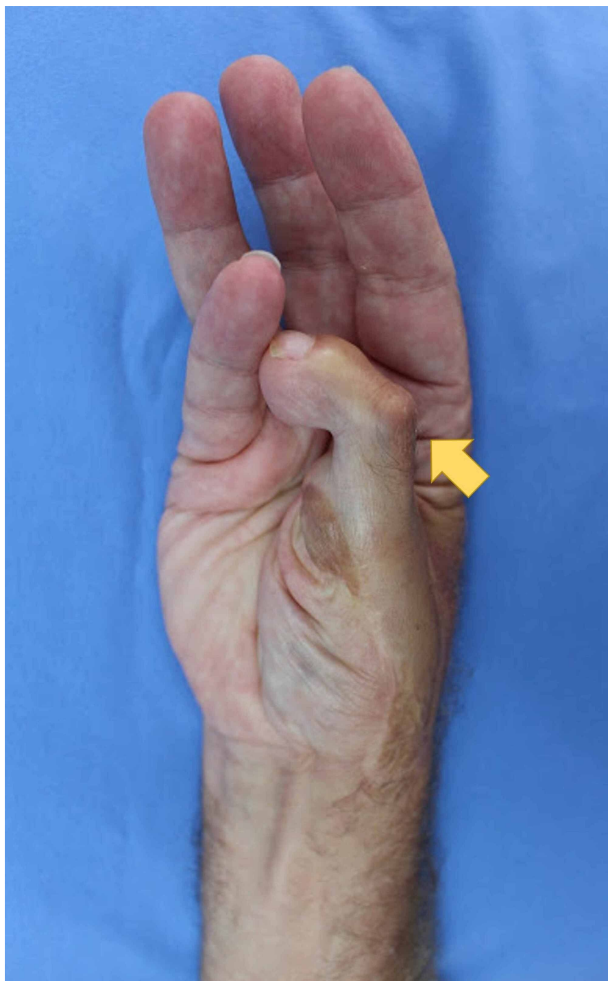
FIGURE 4: The Kapandji test being performed by the patient's right hand, scoring 7 out of 10