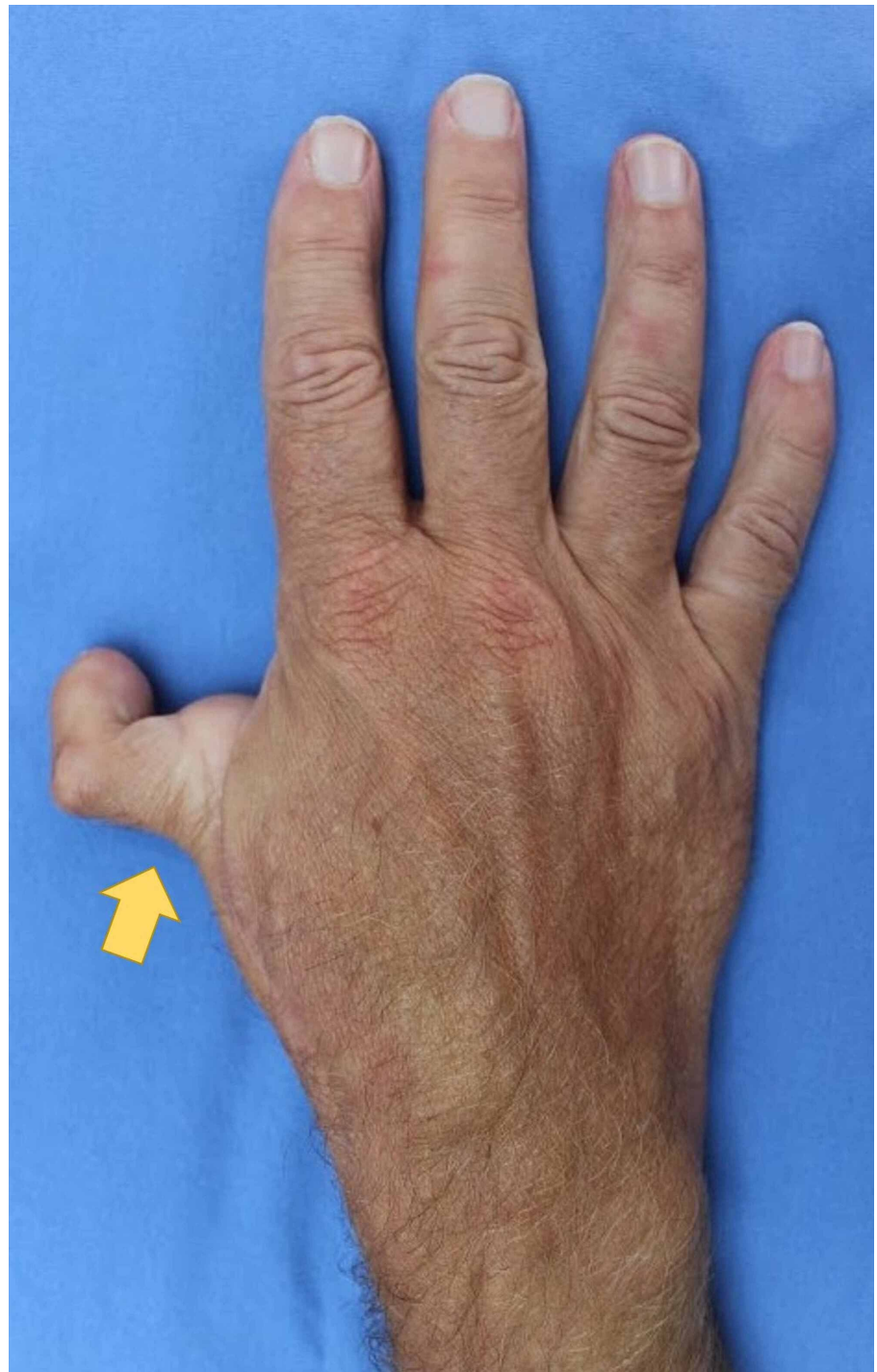
FIGURE 2: The dorsal surface of the right hand, demonstrating the dorsal aspect of the neothumb