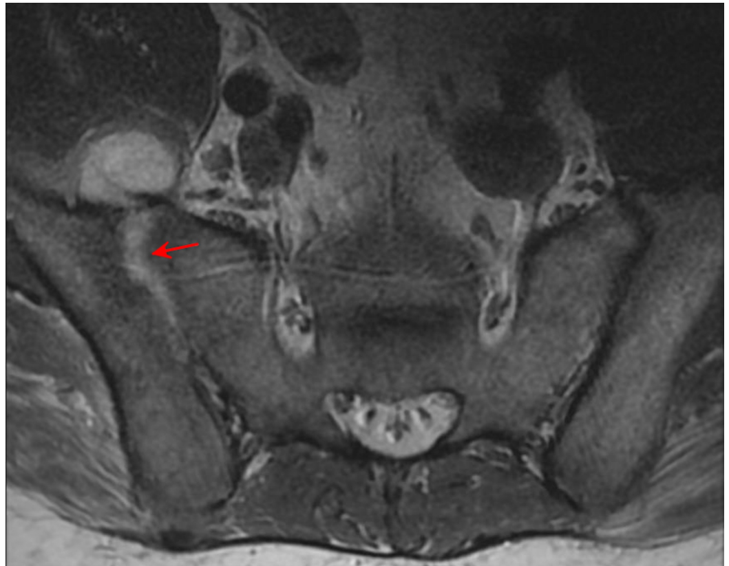
FIGURE 2: Preoperative magnetic resonance imaging (MRI) displaying right sacroiliac joint effusion with edema

A pin was placed on the opposite (left) posterior superior iliac spine (PSIS) to support the reference frame used in navigation. Intraoperative CT was performed to obtain data acquisition. The SI joint was identified and decorticated. Purulent material within the SI joint was aspirated and sent for microbiological and histologic studies. Under Stealth navigation guidance, the SI fusion was carried out using the Medtronic Rialto™ SI Fusion System (Medtronic, MN, USA). On the first postoperative day, the patient was able to transfer to a chair from his bed without difficulty, was able to ambulate more than 50 feet, and reported a significant reduction of pain.