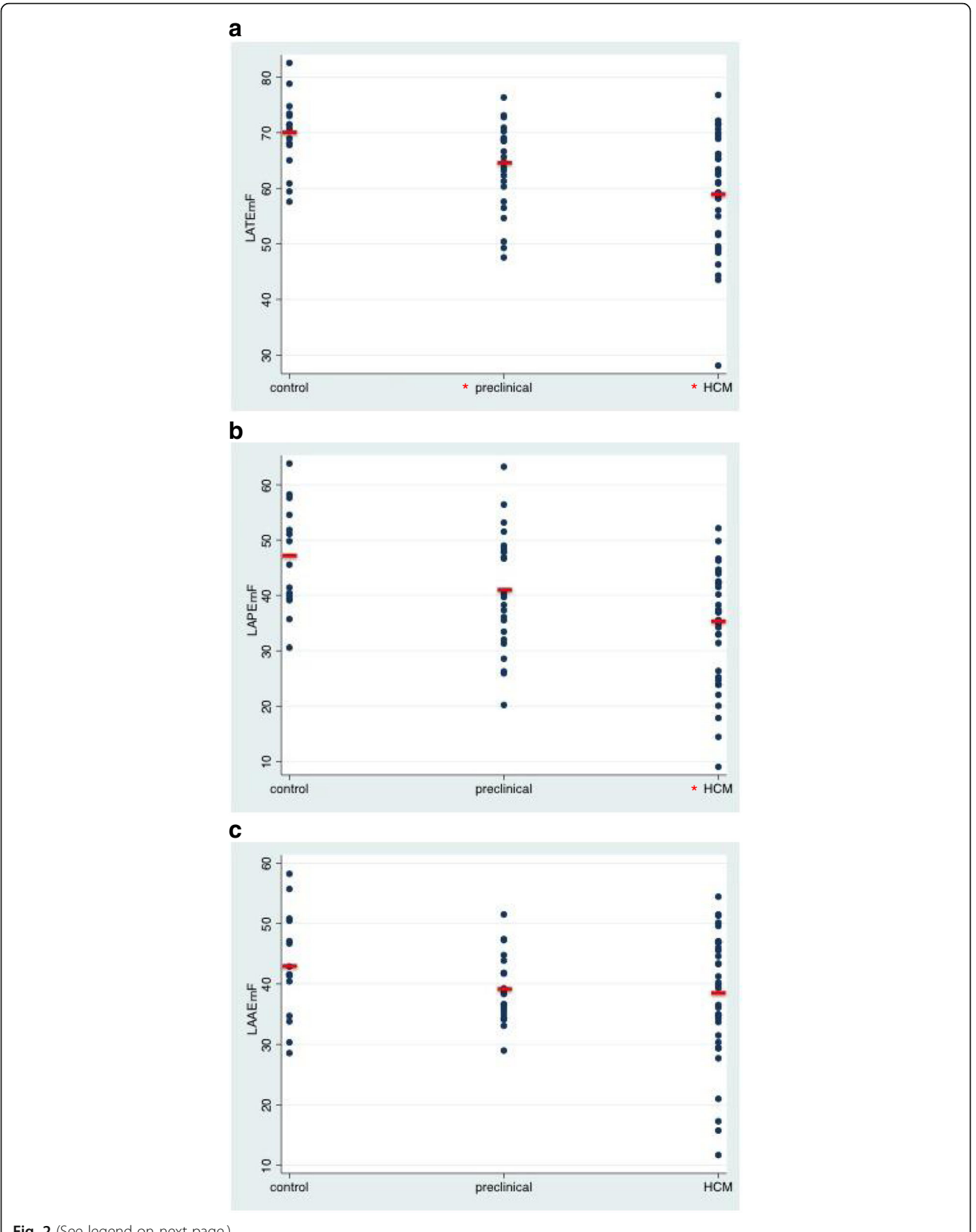
Fig. 2 (See legend on next page.)