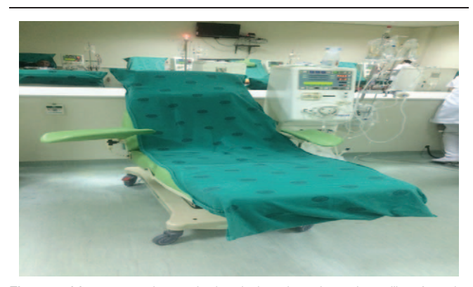
Figure 4. Maca next to the monitoring device where the patient will perform the exercises.

The KDQOL-SF protocol will be used to evaluate QoL. It is a self-enforcing questionnaire of 80 items divided into 19 dimensions. It includes the short-form health survey as a generic