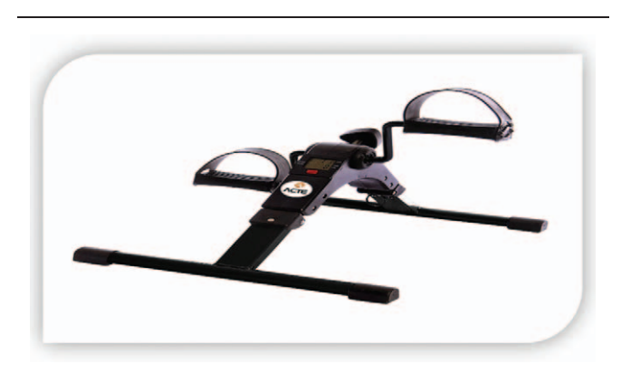
Figure 5. Mini bike compact - E 14.