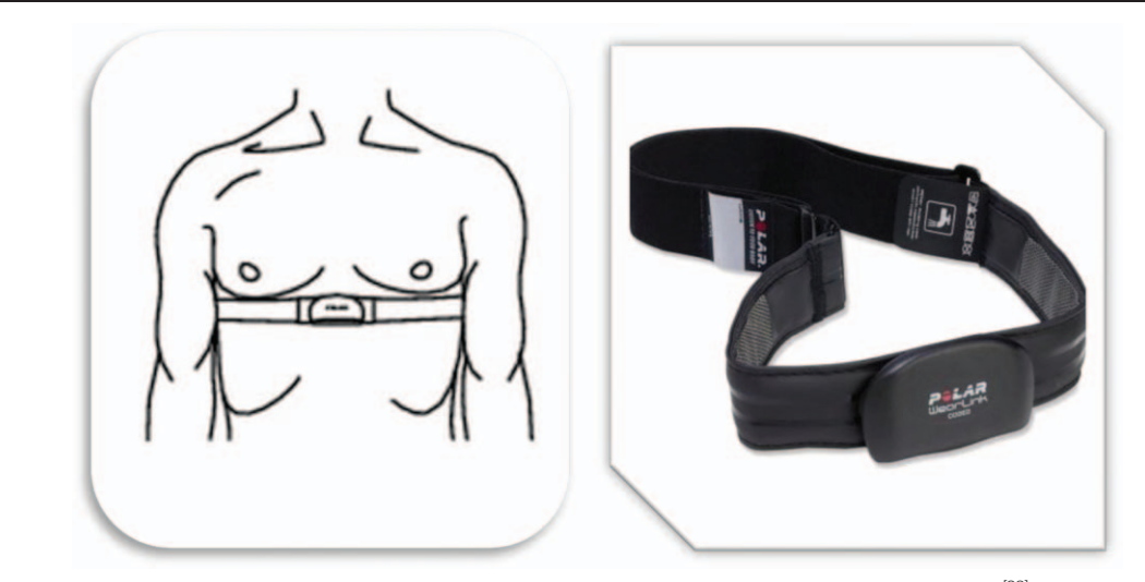
Figure 2. Placement of the strap on the patient. [23]

All patients will be assessed at the beginning of the exercise and every 5 minutes throughout the 30 minutes of the active phase, the HR and BP will be measured by the Bellco Formula Plus dialysis machine (Formula 2000 plus Domus SW 5.8, Mirandola, Italy) (Fig. 4).