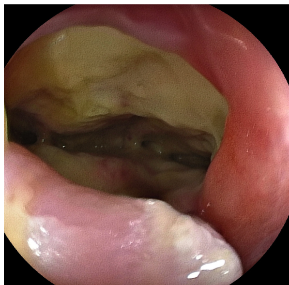
Figure 1. The colonoscopy revealed a rectovaginal fistula on the rectum 3 cm up from anal verge.

Bevacizumab, Over-The-Scope Clip, rectovaginal fistula.