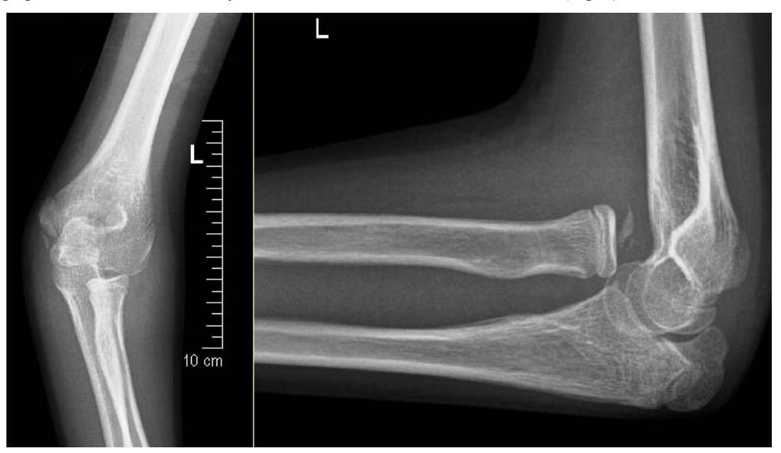
Fig. (1). Radiographic picture of a twelve year old girl who sustained injury to her left elbow, showing anterior dislocation of the radial head (Bado type-1 lesion) with calcification of annular ligament remnants.

A 12 years old female child, sustained left elbow injury while playing. Residual displacement of the radial head had been overlooked and diagnosed as a undisplaced proximal ulna fracture in a local hospital and was immobilized in a splint for 4 weeks. Later, splint was removed and started with physiotherapy. Since child was complaining of pain with limitation of forearm rotation and difficulty in performing her routine activities, her parents approached our hospital after 8 weeks post injury. On initial examination, we noticed protrusion deformity of the radial head and cubitus valgus of 20°. The range of movement was from 25° to 110° of elbow flexion and she had mild restriction of pronation. Radiographs showed ulnar deformity and anterior dislocation of the radial head (Fig. 1).