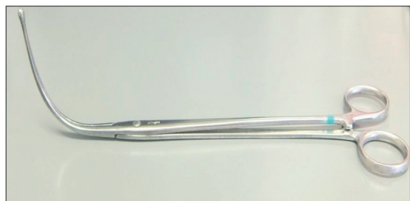
Figure 2. This forceps with a highly-curved and long tip is useful for tunneling through a small incision.

We finally conducted the hepatic transection. Elevating the tape secured the IVC and revealed the hepatic parenchyma incision lines. We transected the peripheral region of the middle hepatic vein that was in contact with the tumor but preserved the proximal region. The transection was performed using the Cavatron Ultrasonic Surgical Aspirator (CUSA; Integra lifesciences Corporation, Newjersey, United States) and EnSeal (Ethicon Endo-Surgery, Ohio United States) (Figure 4).