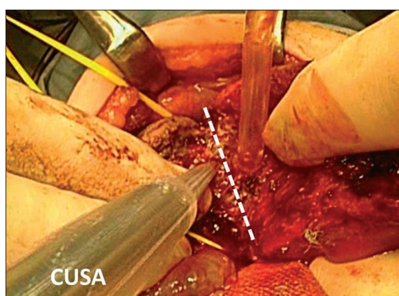
Figure 4. Lifting the liver with a tape, the liver transection was performed primarily using CUSA.

easier to achieve. In addition, retrograde IVC flow may be reduced because the detached surface is raised slightly by venous pressure.