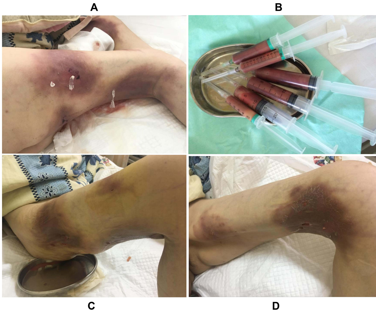
Figure 3 Treatment with cutting the abscesses and lavaging the abscess cavities with fluconazole saline solution (A). A large amount of pus from the abscesses (B). Inflammation within the skin lesions was obviously improved after a week of treatment (C and D).

occurrence of PCC is mainly due to immunodepression as a result of MSCC metastases without treatment. Although the patient succumbed to the progression of the cancer six months after discharge, the topical treatment of fluconazole achieved a favorable outcome with no recurrence of skin lesions. Fluconazole is routinely used as a broad-spectrum antifungal agent in the treatment of cryptococcosis, usually administered orally or intravenously. 18 In addition to this systemic antifungal agent treatment, the abscesses were incised and the abscess cavities were lavaged with fluconazole saline solution, to reduce the progression of the lesions. Although the patient had terminal cancer with multiple systemic metastases, presenting cachexia, hypoproteinemia and was immunocompromised, which increased her chances of being infected, there was no systemic dissemination due to the infection found at the time of admission.