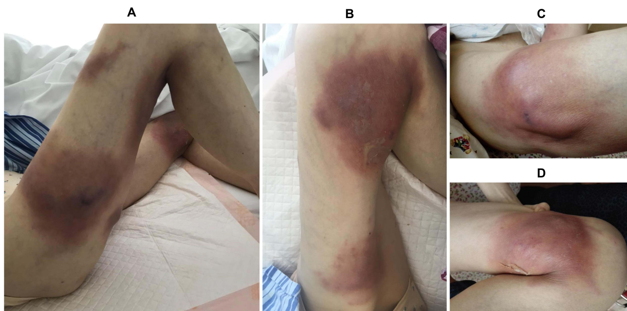
Figure 1 Physical examination of the female patient diagnosed as mediastinal small cell carcinoma complicated with primary cutaneous cryptococcosis. Multiple painful skin lesions with erythema and swelling on both thighs (A and B). Abscesses on both thighs (C and D).