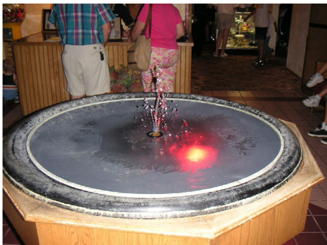
Figure 3 Decorative fountain situated in the lobby of Restaurant A.

where people shopped and worked, and to map grids through which case-patients were significantly more likely than controls to have traveled. Apart from exposure to cooling towers (using map grids as a proxy), analysis of potential exposures where more than half the case-patients had visited did not initially show any significant differences between case-patients and controls. This hypothesis was strengthened by the timing of the outbreak at the start of summer with many towers bearing heavier cooling loads and running in excess of 100% capacity due to a hotter than usual summer in South Dakota. Thirdly, as outlined in the background, cooling towers are common sources of community outbreaks of LD.