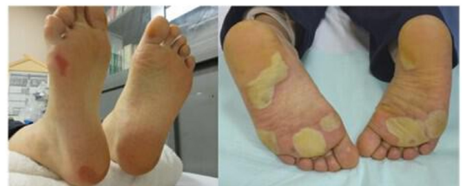
Figure 3 Photo finish for grading of hand–foot syndrome. All the photographs used for a photo finish are taken by the same camera in same light condition room.

The primary endpoint is an incidence rate of grade 2 or more severe hand–foot syndrome (soles of the feet only) assessed by National Cancer Institute (NCI) Common Terminology Criteria for Adverse Events (CTCAE) V.4.0. Hand–foot syndrome is defined as palmar–plantar erythrodysesthesia syndrome in CTCAE V.4 and compositely graded by severity of skin changes, pain severity and limitation of activity of daily living. Grading of hand–foot syndrome will be performed by central review using photographs taken weekly by blinded trained physicians (figure 3). Pain severity and interference will be accessed by patients using 11-point Numerical Rating Scale and 4-point Likert Scale, respectively.